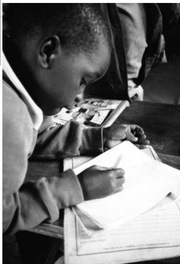
One of the children at the Ray of Hope school, having his photo taken while trying to figure out long division.